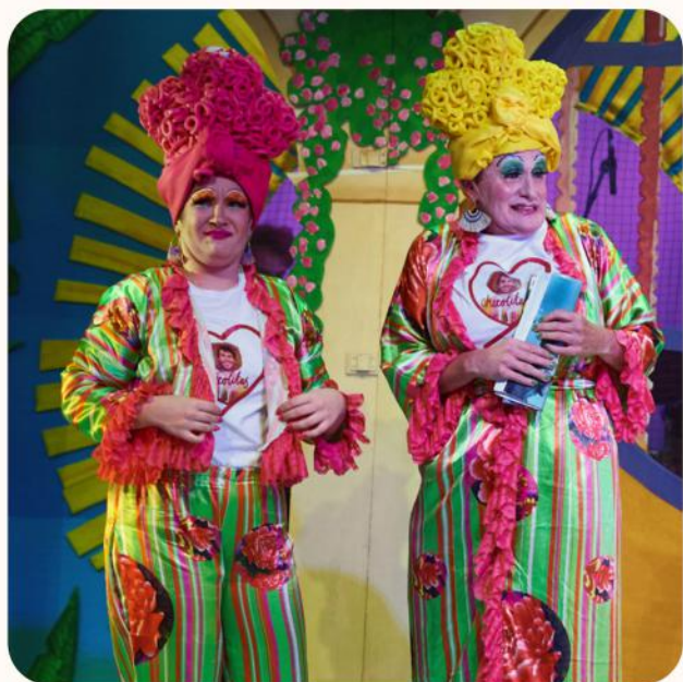
Adnausea & Quosimoda