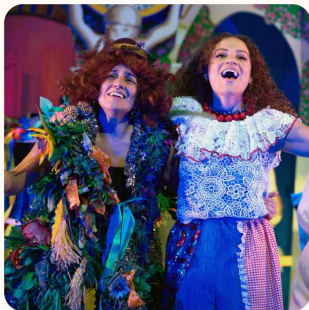
Madre Monte & Cinderella