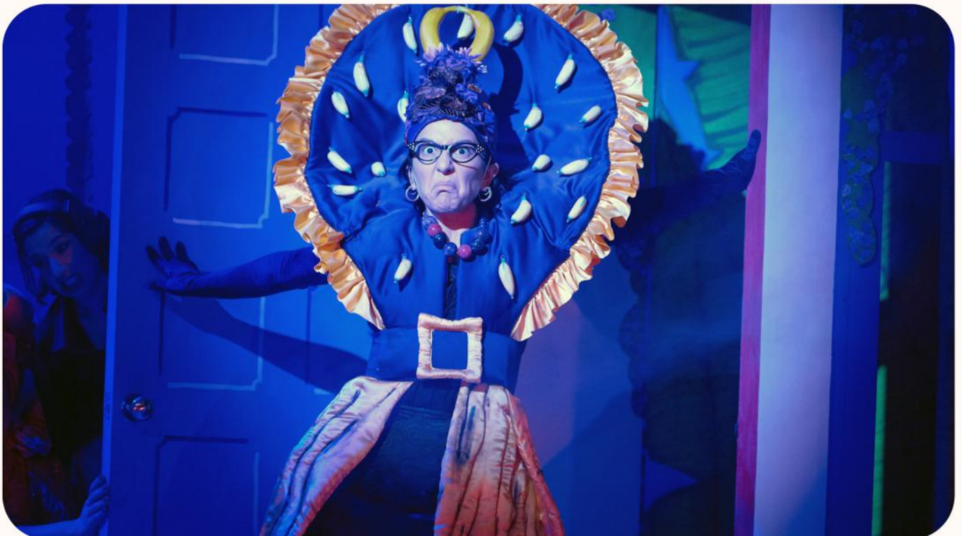
Elsa Lame del Diablo