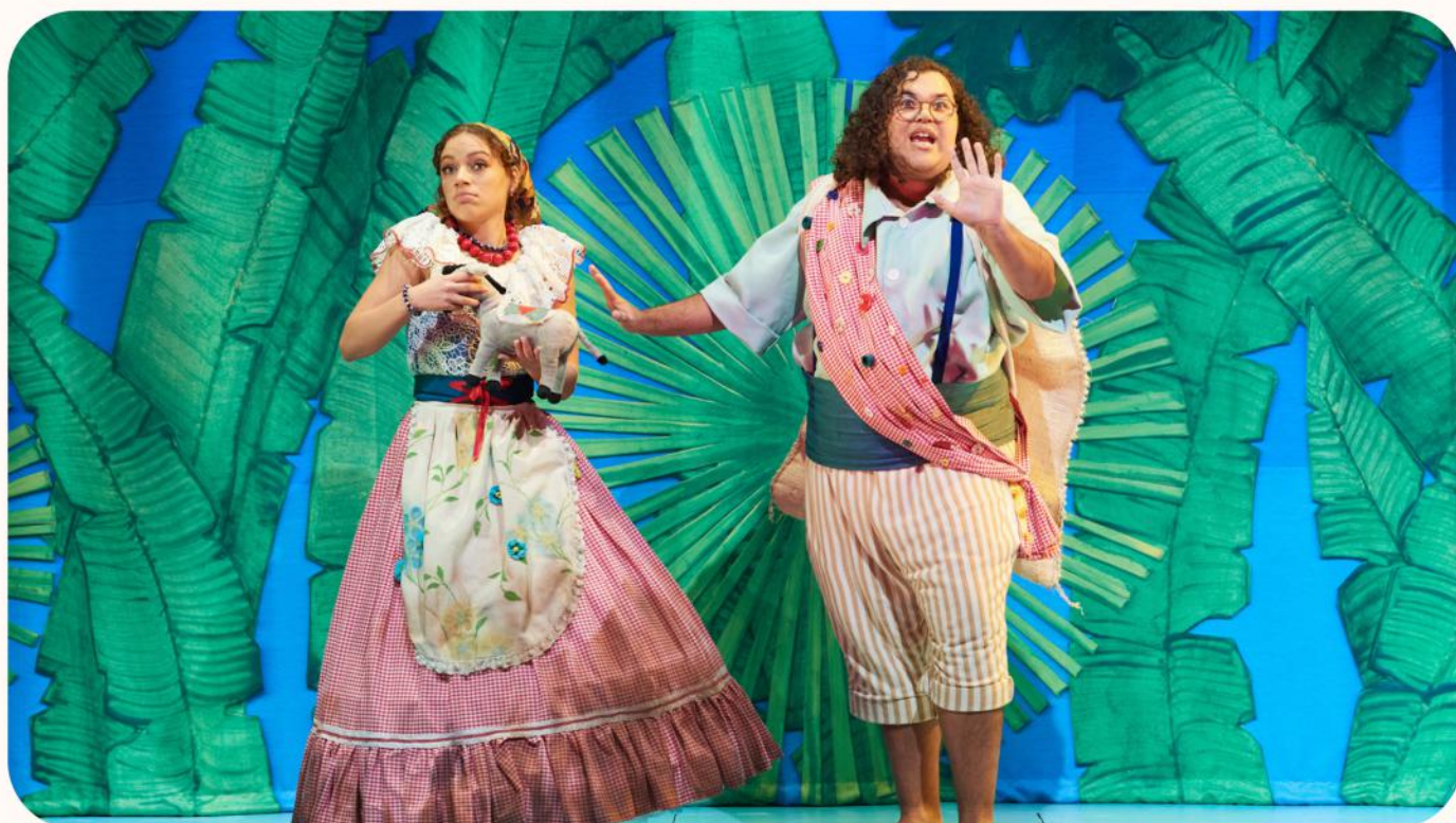
Cinderella and Buttons