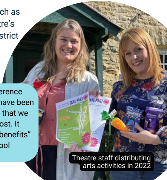
Theatre staff distributing arts activities in 2022

“The lunches have made a massive difference over the school holidays & the children have been able to access the theatre to see shows that we wouldn't normally take them to due to cost. It makes such a difference to families on benefits” Parent of Family supported by Free School Holiday Meal Programme